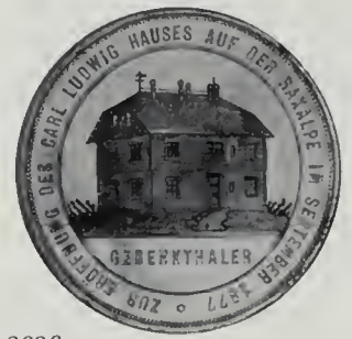
Lot No. 2626

Gedenktaler, 1877. Commemorates the reopening of the Mount Raxalpe Inn. Obv. Bust of the Archduke Carl Ludwig as Protector of the Austria Tourist Club. Rv. The Inn. Dav.30. Only 100 pieces struck . A lightly hairlined Brilliant Proof. Very rare. (4,500–5,000)